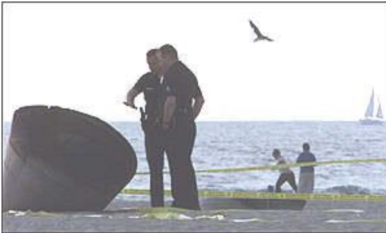
Aircraft parts found on Dockweiler State Beach: August 2000